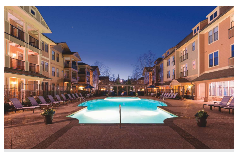
JLL Income Property Trust acquired The Reserve at Johns Creek Walk, a 210-unit apartment community in metro Atlanta, for $47 million.